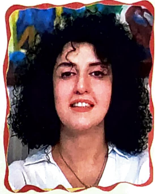
Nobel Prize 2023 Winners : p. 218