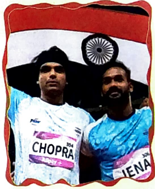
19th Asian Games : p. 216