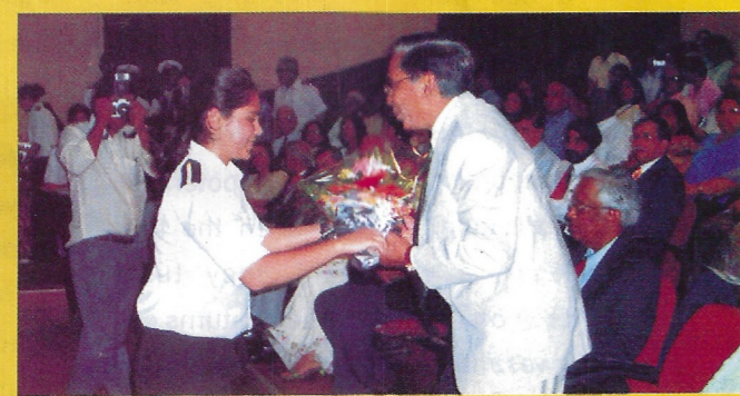
Chief Guest welcomed by a TMI Lady Cadet.