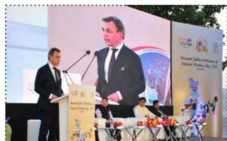
Chief Guest Mark Harbers-Minister for Infrastructure and Water Management, Kingdom of the Netherlands

The Chief Guest for the function was Minister for Infrastructure and Water Management, Kingdom of the Netherlands Mark Harbers, and the event was presided over by Union Minister of State for Ports, Shipping, and Waterways, Shantanu Thakur.