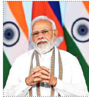
Varanasi workshop in two themes: Gati Shakti NMP and National Logistics Policy,

The first day of the workshop will focus on Gati Shakti NMP. It will feature discussions of central infrastructure, economic and social sector ministries/ departments with states and UTs, demonstration of best use cases by ministries, states and UTs on their planning of multimodal infrastructure projects using the principles of Gati Shakti and presentations on various focus areas and initiatives under Gati