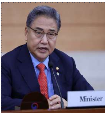
South Korean foreign minister Park Jin

South Korean foreign minister Park Jin who is on an official visit to India highlighted the commonalities between the two sides and their commitment to the Indo-Pacific. "We are both exemplary democracies, vibrant economies and cultural powers and we are both committed to contributing to a free,