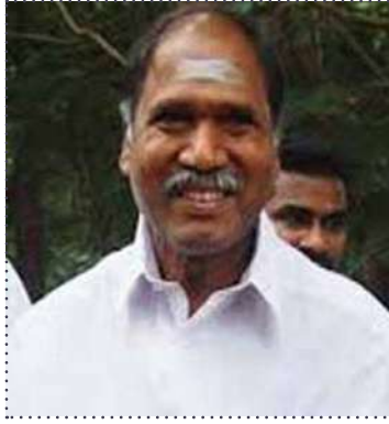
Chief Minister Rengaswamy

The state Chief Minister Rengaswamy is understood to have asked the Chief Secretary to explore the scope for reworking the concession agreement we had with Marg in 2006," according to media reports. The 2006 Memorandum