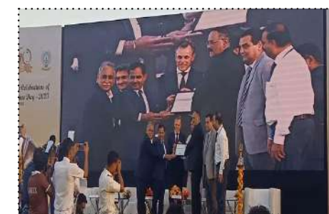
Outstanding Indian Ship-owning & also Indian Employers for seafarers- SCI