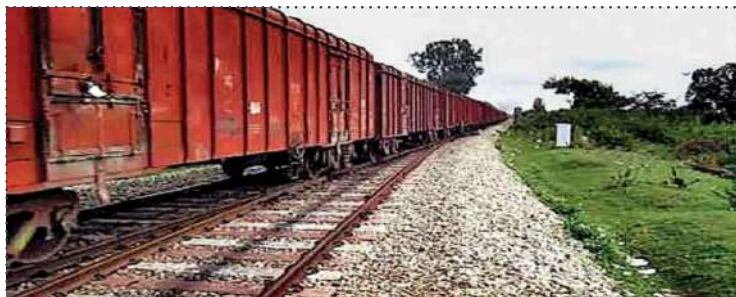
NPG evaluates railways projects

The Jaipur-Sawai Madhopur route serves as a feeder to the Delhi-Mumbai route, and it represents the primary conduit connecting Jaipur, its environs, and Mumbai, southern and eastern parts