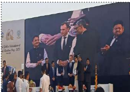
Outstanding Maritime Training Institutes Pre sea Trg (2nd Rank)- TMI