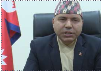
Nepal's Foreign Secretary Paudyal

The proposal was made by Nepal's Foreign Secretary Paudyal when he met Sun Weidong, Chinese Vice Minister for foreign affairs in Beijing on April 8th.