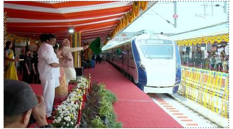
PM Modi flagging off Secunderabad-Tirupati Vande Bharat Express

Telangana Governor Tamilisai Soundararajan, Railways Minister Ashwini