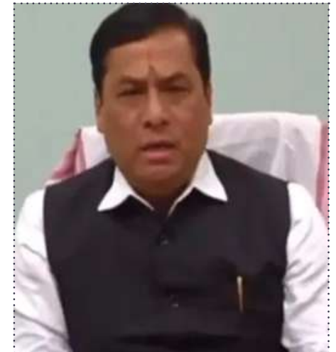
Shipping Minister Sonowal

Shipping has been among the few departments along with coal and mines ministries, which have exceeded their monetization targets last fiscal. For FY23, the Centre had set a target of ₹1.62 trillion, and till FY25, the government seeks to monetize assets worth ₹6 trillion under the NMP.