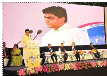
Shri Shantanu Thakur-The Union Minister of State for Ports, Shipping, and Waterways

Sonowal was read, he said he is very pleased to learn that the theme adopted for the 60th edition of the National Maritime Day 2023 celebrations is Amrit Kaal in Shipping. This theme refers to the most auspicious period to start new ventures which also holds true for shipping, said the Minister.