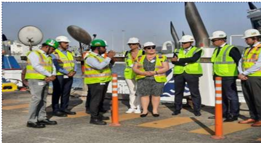
GTI welcomes Dutch delegation at the terminal