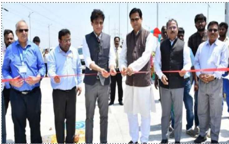
The Union Minister of State for Ports, Shantanu Thakur, visited Jawaharlal Nehru Port Authority (JNPA), recently