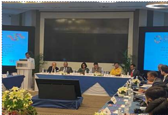
Trans-Asian Railway members set to finalize a regional strategy on accelerating rail digital transformation

A High-Level Conference on Accelerating Rail Digital Transformation in Asia and Pacific region was held in New Delhi, India on April 5 and 6. The Conference was organized by United Nations Economic and