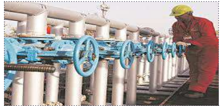
The new pricing guidelines will be effective , April 08, 2023

After a record performance of gas divisions in Q3 FY23, the overall profitability of ONGC and Oil India is expected to moderate over the short-term due to a downward revision in the APM gas prices under the new gas pricing regime.