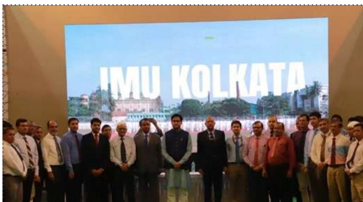
IMU-Kolkata hosting Passing out, Prize Distribution ceremony with State Minister of Ports Thakur as the chief guest

The ceremony began with the lighting of the lamp by the Union Minister Shri Shanthanu