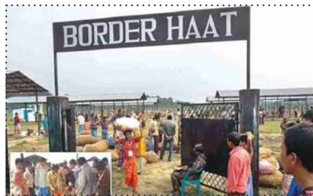
India wants Border Haats to function