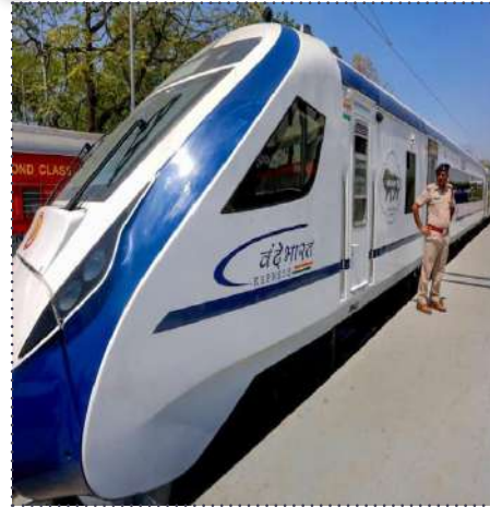
Vande Bharat Express

The new Vande Bharat Express will cover the distance between Delhi Cantt. and Ajmer in 5 hours 15 minutes. The present fastest train in the same route, Shatabdi Express, takes 6 hours 15 minutes from Delhi Cantt. to Ajmer. Thus, the new Vande Bharat Express will be faster by 60