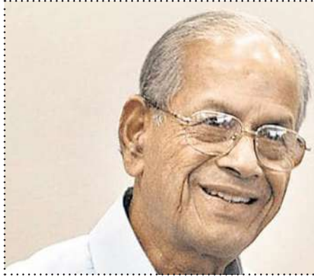
Metro Man Sreedharan

TIRUVANANTHAPURAM Sagar Sandesh News BUREAU