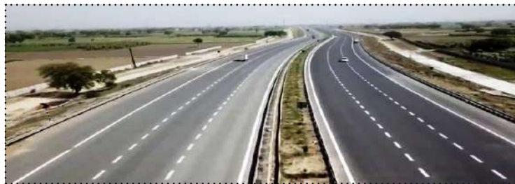
Six lane highway for 5 km sanctioned for VOC Port for road connectivity

In a bid to improve mobility to the port site a