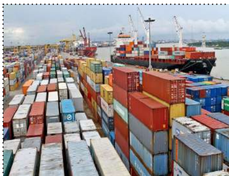
Dates Stuck at Chittagong Customs after Tariff Hike

"The tariff for dates has been increased in light of the decision of the National Board of Revenue (NBR). No clearing and forwarding (C&F) agents cleared the bill of entry on import of date on Wednesday after the tariff