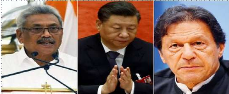
Sri Lanka and Pakistan prime beneficiaries of Chinese lending