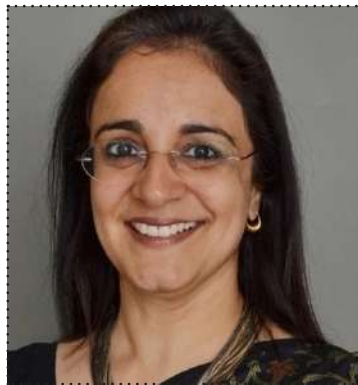
SEBI chief Madhabi Puri Buch

The regulator was holding its first press meet since the