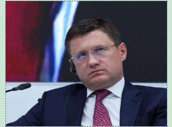
Russian Deputy Prime Minister Alexander Novak

Russian Deputy Prime Minister Alexander Novak said Russia needed to focus on boosting energy exports to so-called "friendly" countries, as he