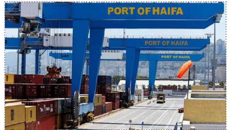
During nationwide protests, Haifa Port like many other ports, ceased to work

Shares of Adani Ports have plunged as much as 30 per cent in the year 2023 so far, whereas it is trading 40 per cent below its 52-week high at 987.90 on September 20, 2022.