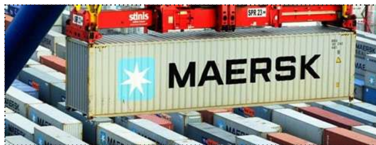
Maersk believes supply chains "are finally beginning to stabilise and find equilibrium"

And on its Asia to Latin America trades, Maersk