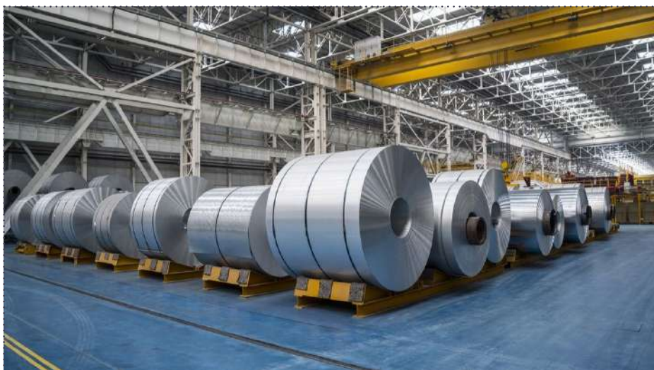
This is the first-ever strategic partnership entered into by an Indian company for securing stake in nickel reserves globally