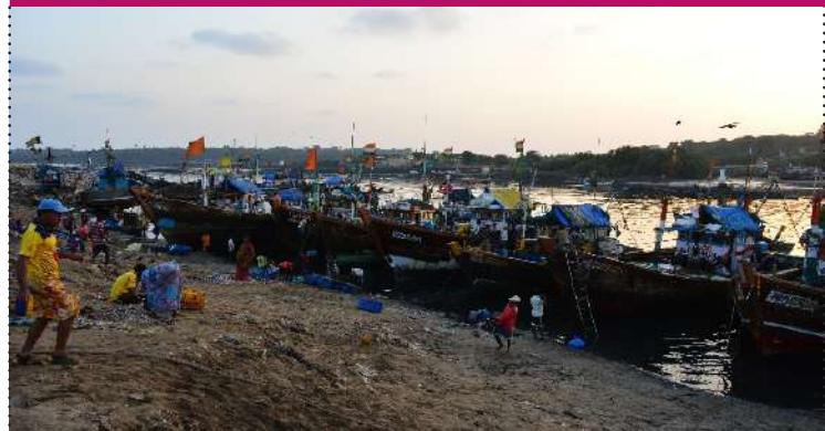
Fishing harbor at Versova beach

We can't afford to lose more of it according to environmentalists.