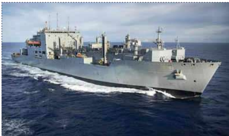
US naval ship Matthew Perry has completed the repairs in Larsen and Toubro ship yard at Katupalli near Chennai.

The larger scope of work on Matthew Perry reflects