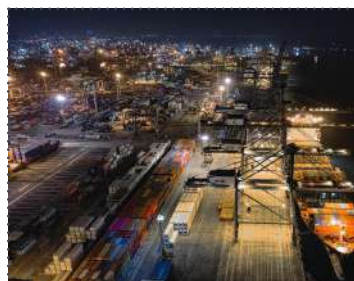
Cross border shipping solutions to domestic SMEs from Shiprocket X

The collaboration with eBay is aimed at enabling e-commerce for Indian sellers and helping them reach a global audience and to provide cost-effective and seamless cross-border shipping solutions to Indian eBay sellers by integrating