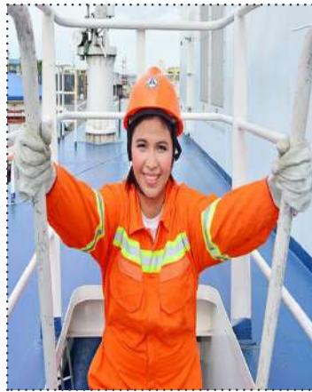
BW LPG India Pte Ltd is stepping up efforts to attract more women to a career at sea thus improving gender diversity

"The scholarships cover all academic fees so that cadets can focus more on their studies and less on